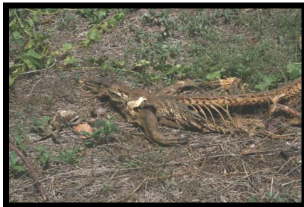
FIGURE 1. A radio-tracked Yellow-spotted Goanna ( Varanus panoptes ) that we found dead in August 2006 with a dead Cane Toad ( Bufo marinus ) found approximately 20 cm from its head.

We used more powerful transmitters and a different methodology for attachment to goannas in subsequent years. In September 2003, we attached the transmitters (Holohil model # AI-2B; 43 x 15 mm, mass 30 g, battery life expectancy 36 months) to the tails of another 10 male goannas. The SVL of these males ranged from 50 to 66 cm and mass ranged from 2,287 to 6,010 g. In September 2005, we radio-tagged another five males (SVL 58–66 cm, mass 2,875–5,050 g). We anaesthetised the goannas using halothane and drilled two holes, 45 mm apart, through the dorsal part of the tail about 30 cm from the vent. Two plastic cable ties inserted through the holes of the tail and brass casing of the transmitter held transmitters sufficiently tight so that the transmitters remained aligned along the tail. As the dorsal part of the tail consists mainly of cartilage, and very thick keratinous skin, this method resulted in