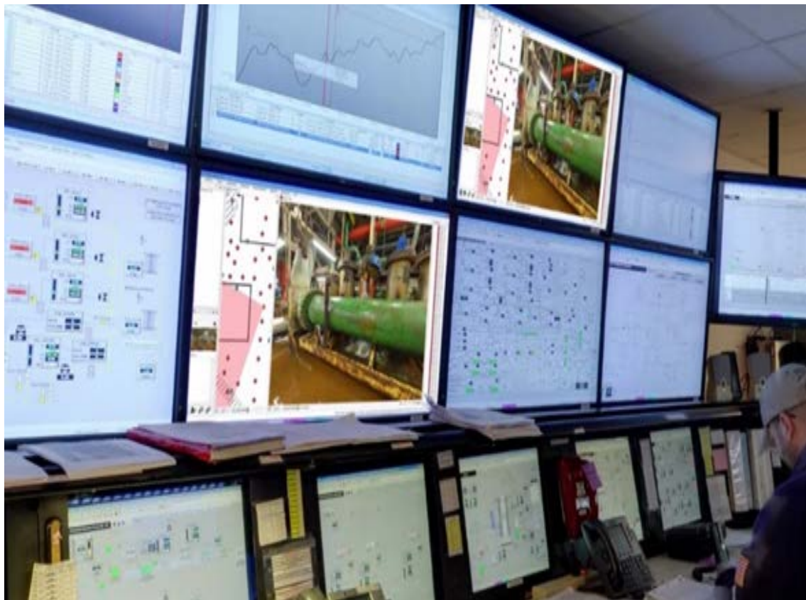
Figure 2: Asynchronous and distant collaboration using VAM in R2S