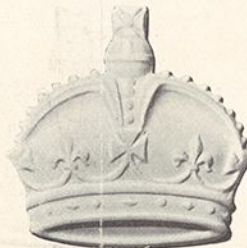
CROWN No. 1358—Zinc. Size 6 ins. x 6 ins.