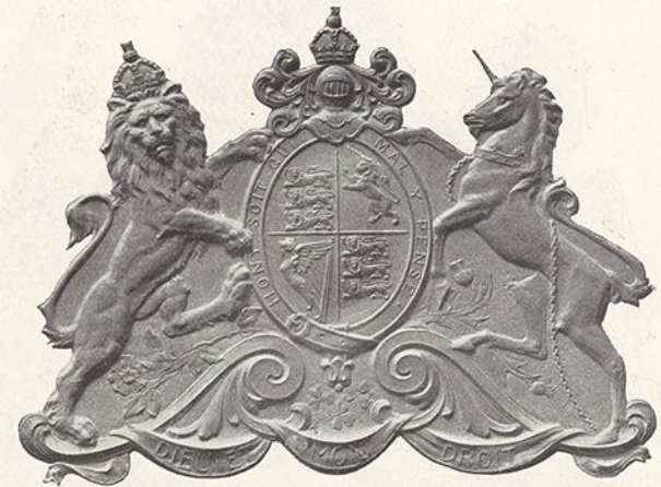
ROYAL COAT OF ARMS No. 1357—Steel. Size 30½ ins. x 22½ ins.

WUNDERLICH EMBOSSED METAL DECORATIONS ARE AVAILABLE ● UNDECORATED OR BRONZE SPRAYED ●