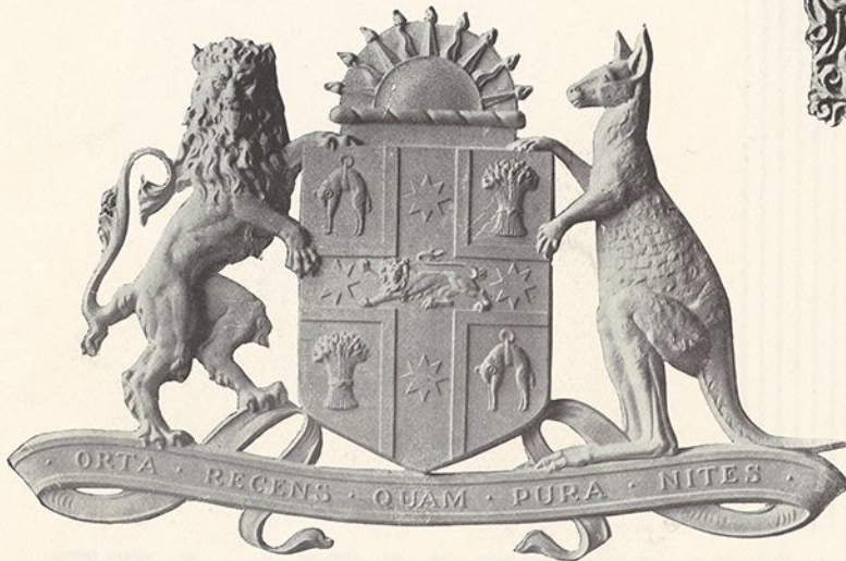
NEW SOUTH WALES COAT OF ARMS No. 1408—Zinc. Size 53½ ins. x 36 ins.