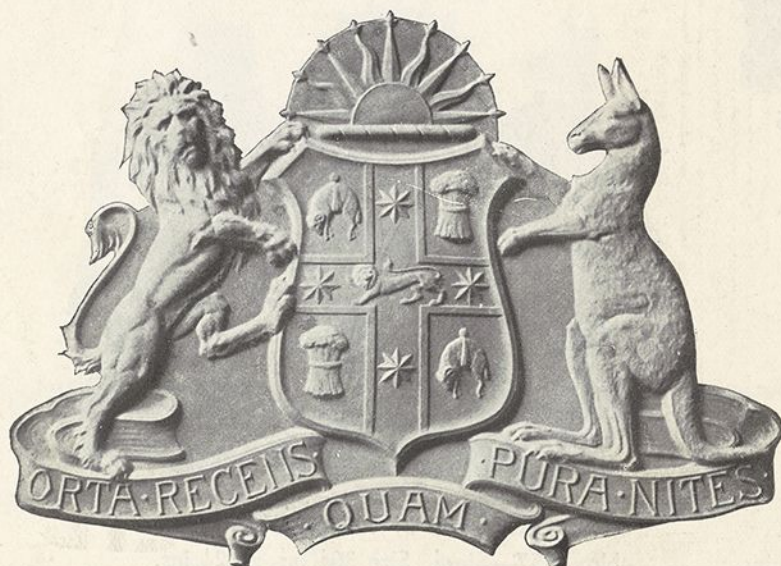
NEW SOUTH WALES COAT OF ARMS