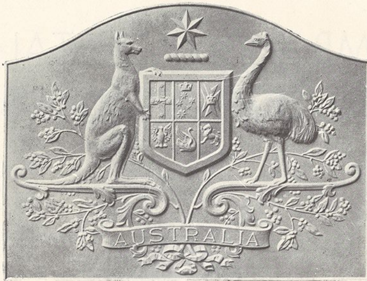
COMMONWEALTH COAT OF ARMS No. 1506—Steel. Size 30 ins. x. 23 ins.