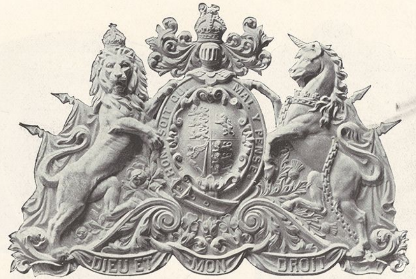
ROYAL COAT OF ARMS No. 580—Zinc. Size 54 ins. x. 36 ins.