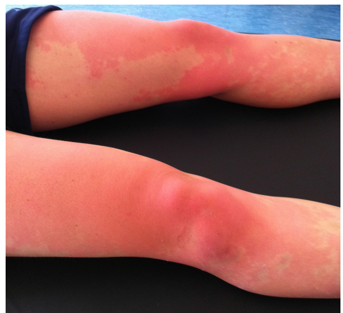
Figure 1 Patient's legs on presentation; this rash was generalised.