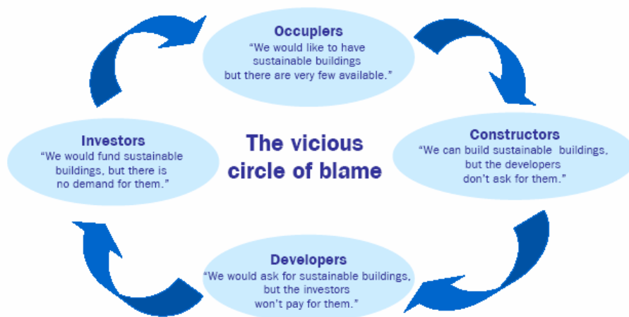
Figure 1. Circle of Blame