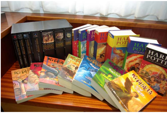
The Harry Potter series has had worldwide influence

To figure out to what degree Rowling's comments should influence our interpretation of the highest-selling book series in history, we can turn to a standard idea within literary criticism.