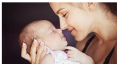
Figure 2. Facebook advertisement.

Growing healthy program growinghealthy.org.au Got a baby less than 3 months old? Join for a FREE APP & GIFT VOUCHER! Places are limited.