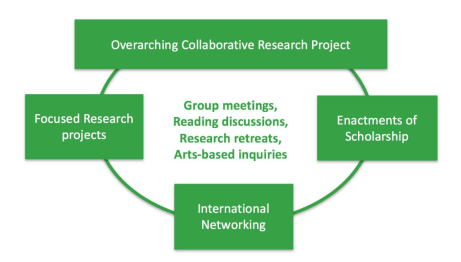
Figure 2: The Collaborative Reflective Experience and Practice in Education (CREPE) Faculty Research Group research model

The collaboration model (Figure 2) became the strength of our collaborative research. By living these elements and processes, we generated not only a stronger community, but affirmed our conceptual and methodological knowledge, skills, and dispositions. We have come to understand the nature of collaboration and live the benefits of this close collegial research through meta-reflective processes, framed theoretically and methodologically.