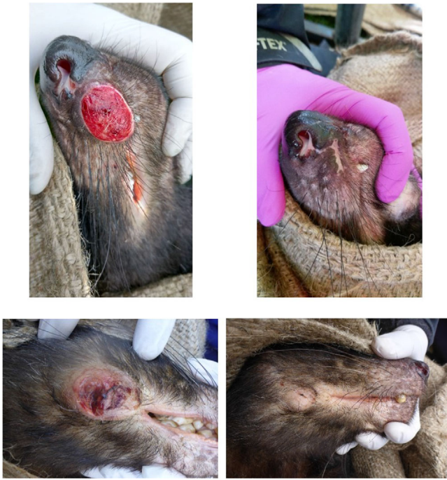
Figure 1. Two wild Tasmanian devils with DFTD (left) and after natural tumor regression 3 months later (right).

rescue (Grueber et al. 2019) are being tested, as are field immunizations aimed at stimulating an adaptive immune response (Pye et al. 2018). However, the epidemiological and evolutionary consequences of introducing naïve individuals from insurance populations into diseased populations have not been evaluated comprehensively, thus, current management is unlikely to prevent transmission. Darwinian principles, host-pathogen coevolutionary theory, and the growing literature on ecological and evolutionary principles in oncology (Korolev et al. 2014) suggest that silver bullets are unlikely to result in disease eradication. We considered evolutionary biology and ecology of host-pathogen interactions to highlight why the role of natural selection in host adaptations to cancer should be considered in the management of this species and other epizootics.