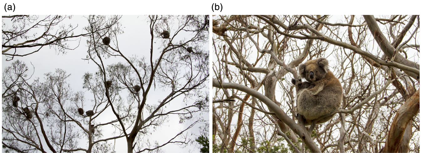
FIGURE 1 Koala overabundance at Cape Otway in November 2013. (a) Koalas converged on trees that had not been completely defoliated, and (b) individuals became nutritionally stressed and starved to death