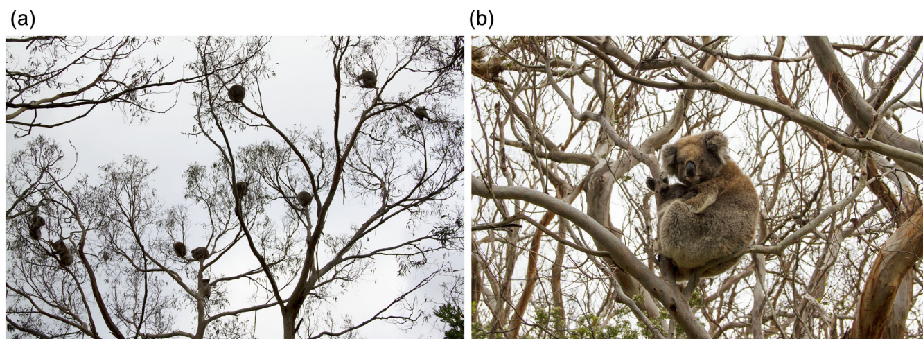
FIGURE 1 Koala overabundance at Cape Otway in November 2013. (a) Koalas converged on trees that had not been completely defoliated, and (b) individuals became nutritionally stressed and starved to death