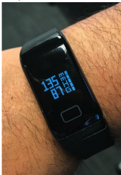
Figure 1. Wearable blood pressure device (T2 Mart blood pressure device).

Data from the wearable and ambulatory devices were downloaded from the Wearfit app and onboard memory, respectively, after the participation period. Home BP measurements were recorded manually on a preformatted study log.