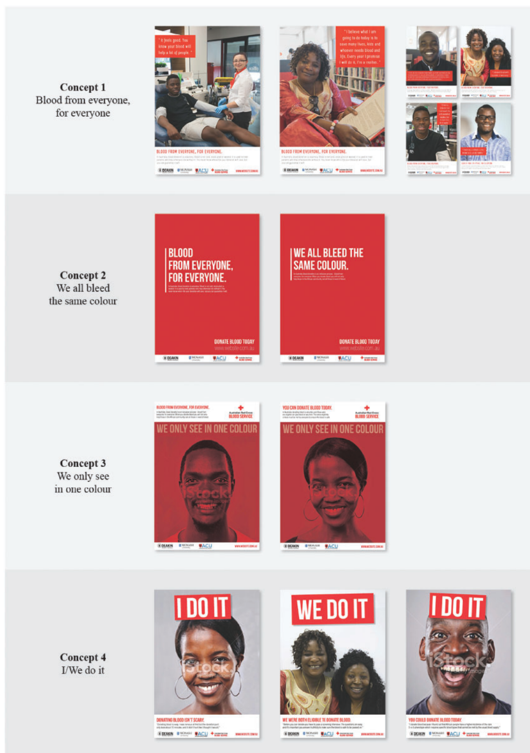
Fig. 1: Poster concepts.