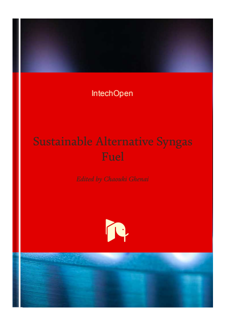
Sustainable Alternative Syngas Fuel