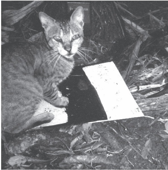
Plate 1 Application of a tracking plate to monitor invasive mammal species in the Caribbean National Forest, Puerto Rico.

per number of traps available, corrected for sprung traps. Rats were euthanized by cervical dislocation.