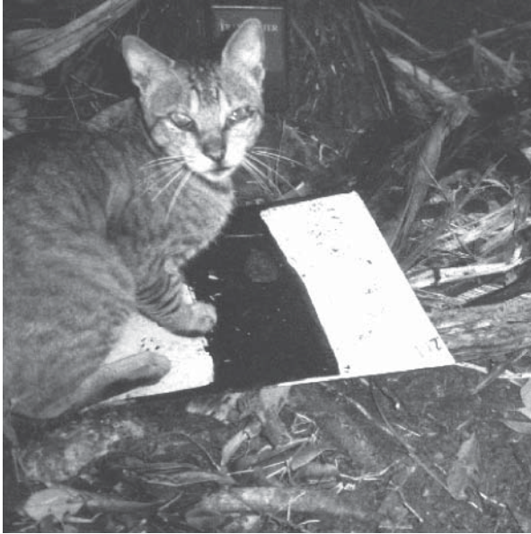
Plate 1 Application of a tracking plate to monitor invasive mammal species in the Caribbean National Forest, Puerto Rico (photo by D. Whisson).

per number of traps available, corrected for sprung traps. Rats were euthanized by cervical dislocation.