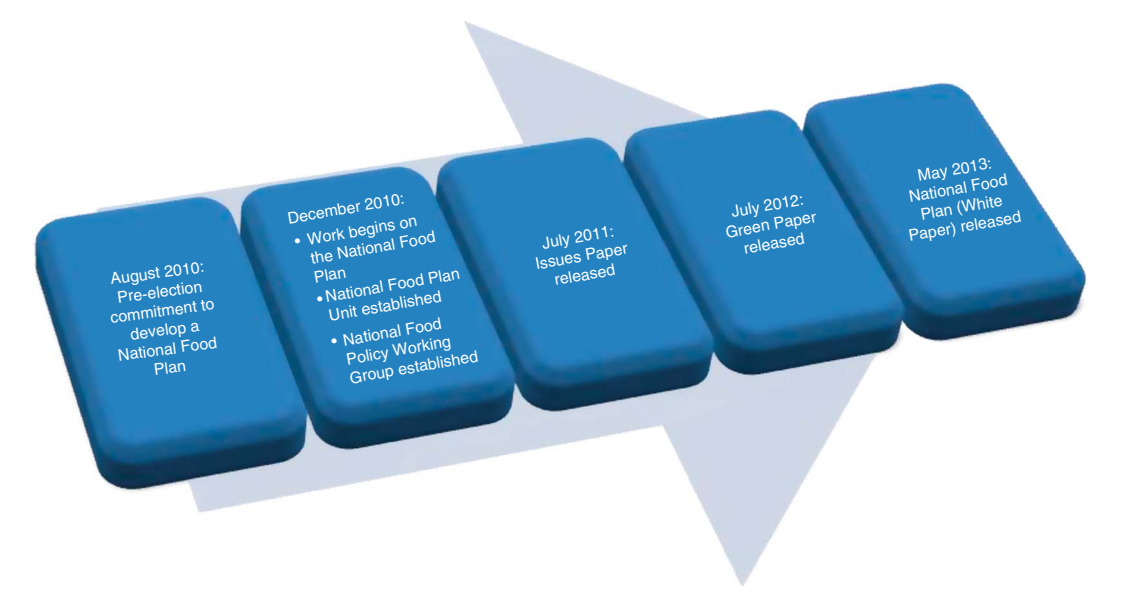
Fig. 1 Stages of development of Australia's National Food Plan from August 2010 to May 2013

developed and who was involved in its development (see Fig. 2). The policy triangle approach explores the role of actors informed by the context, process and content of policy development<sup>(21)</sup> and enables a generalized map of a policy area to be developed to aid systematic thinking<sup>(23)</sup>. This structure was used to organise and filter the documents gathered, first chronologically, then based on actors and stakeholder interests and positions. As Walt et al.<sup>(24)</sup> observe, policy analysis is a multidisciplinary approach 'that aims to explain the interaction between institutions, interests and ideas in the policy process' (p. 308). We would add that it is also multilevel in that interests and institutions operate at different levels in the policy world, from local to national. This is the case in Australia, which is a federation of states and independent territories with a parliamentary 'Westminster' system of government.