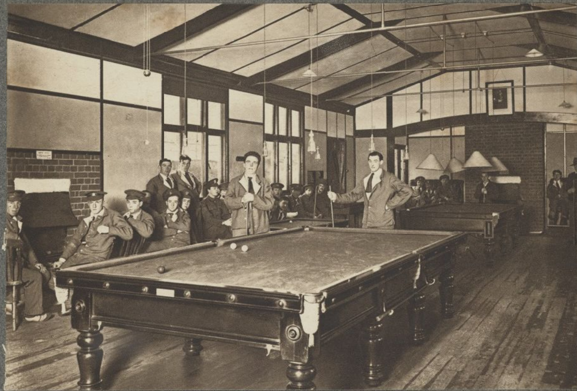
PATIENTS' BILLIARD ROOM.