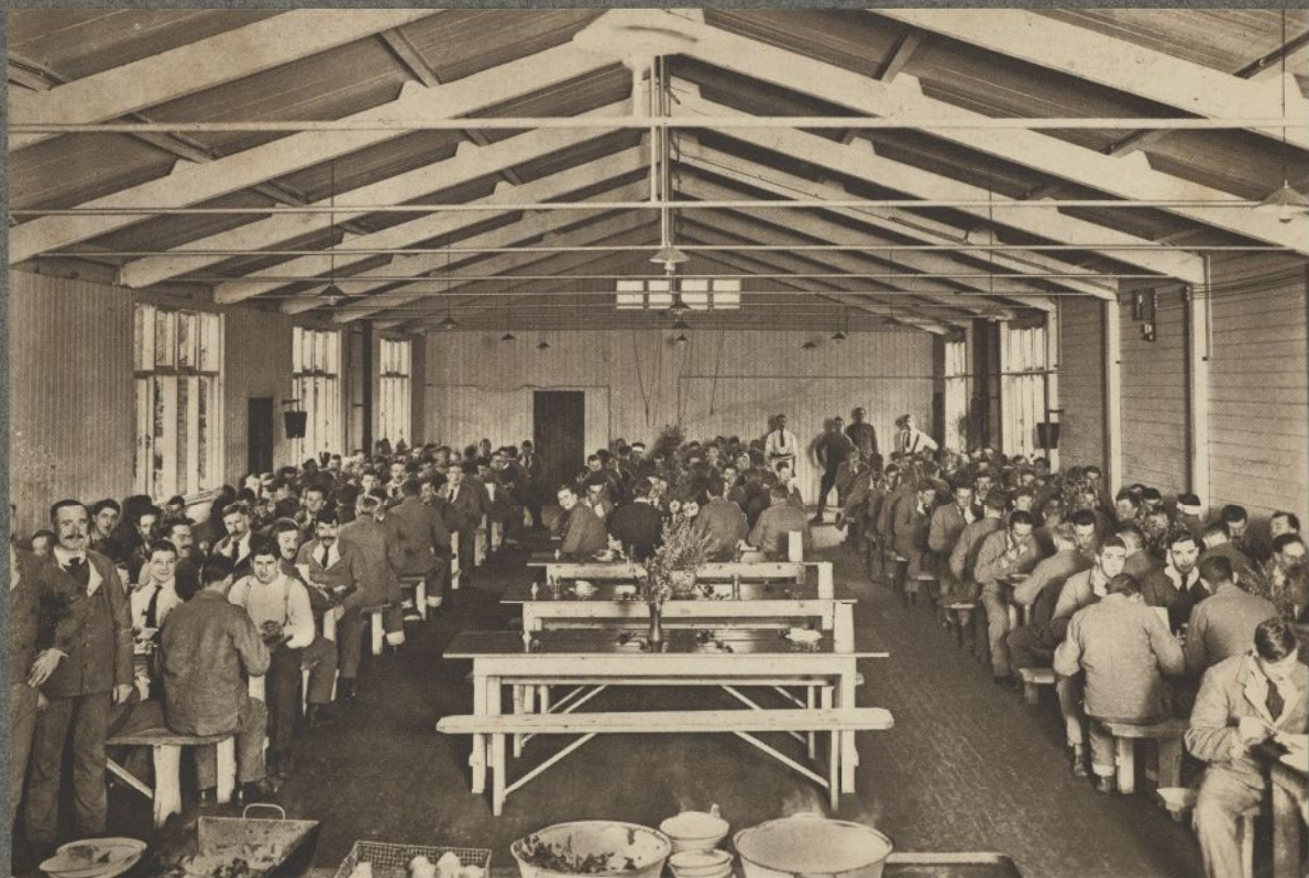
PATIENTS' DINING HALL.