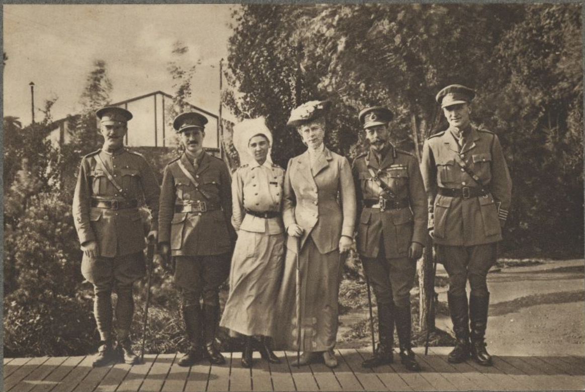
THEIR MAJESTIES' VISIT TO THE HOSPITAL, AUG. 23rd, 1917.