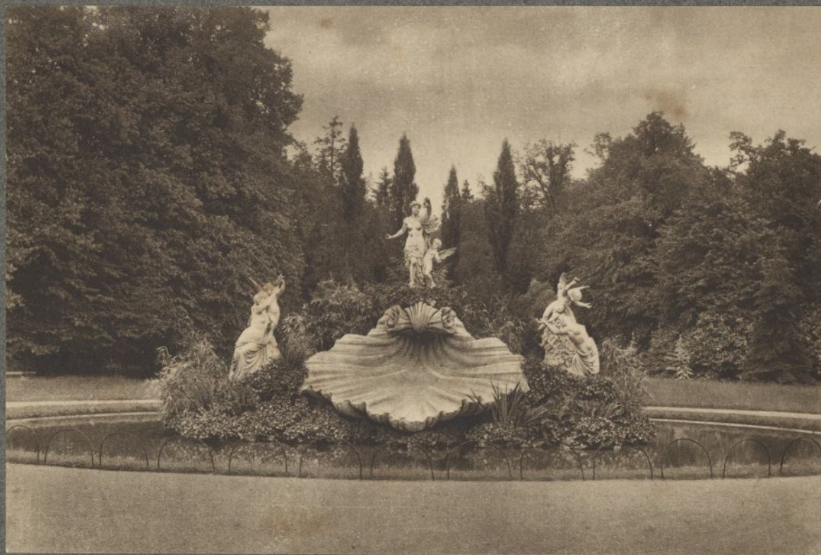
THE SHELL FOUNTAIN, CLIVEDEN.