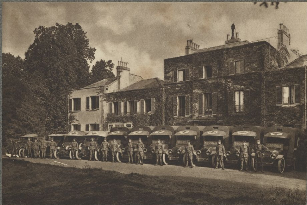
AMBULANCE CARS READY FOR CONVOY OF WOUNDED (OUTSIDE NURSING SISTERS' HOME).