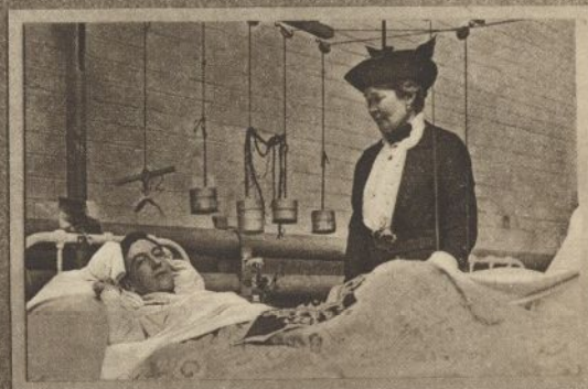
VISITS OF HER MAJESTY QUEEN MARY AND THE LATE DUCHESS OF CONNAUGHT.