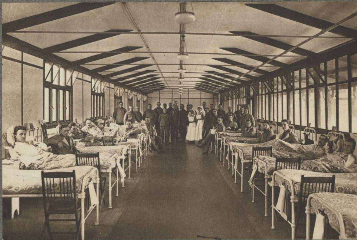
INSIDE ONE OF THE WARDS.