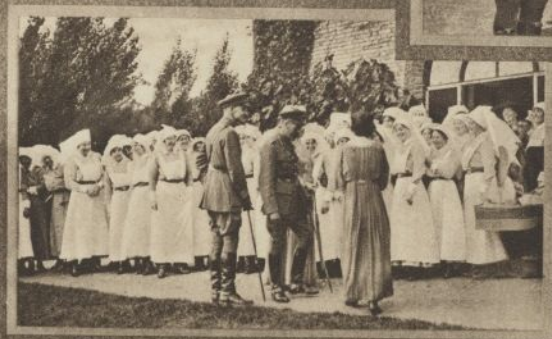
VISIT OF HIS MAJESTY THE KING.