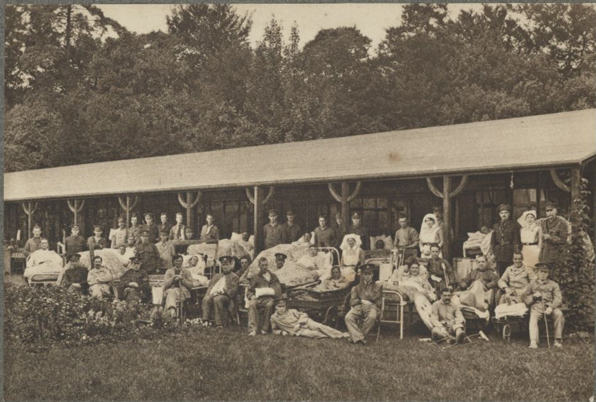
SUMMER-TIME OUTSIDE ONE OF THE WARDS.