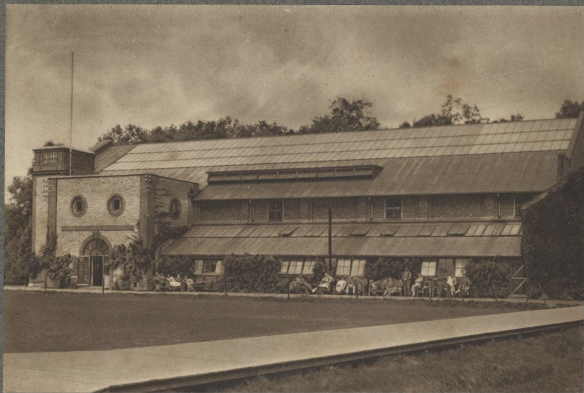
EXTERIOR VIEW OF A, B, C & D WARDS (TENNIS COURT HOSPITAL).