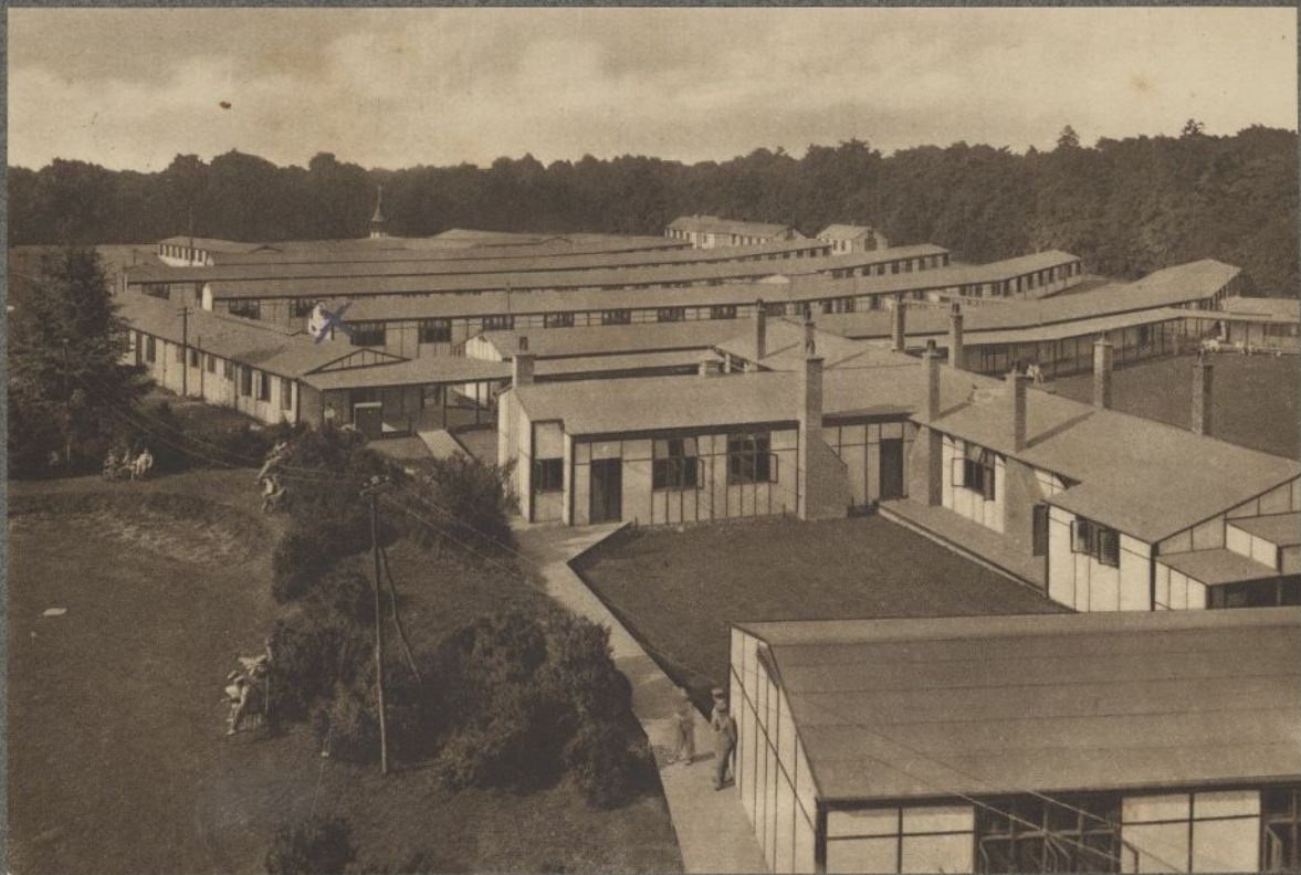
GENERAL VIEW OF HOSPITAL.