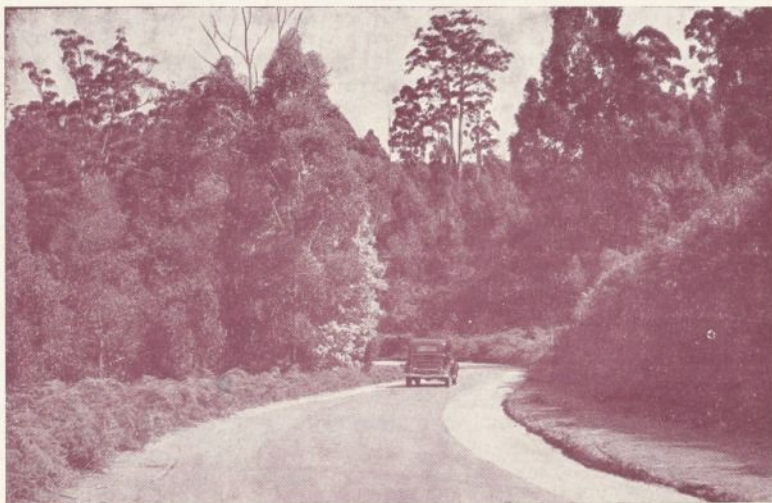
In the Dandenongs

FARE ... 27/6d. each, minimum 4 passengers *