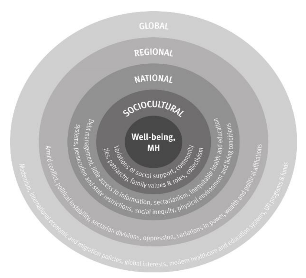
Figure 1: Social exclusion framework showing pathways of exclusionary forces in the Arab world.

Consequently, the prevalent mental health problems among Iraqi refugees in Lebanon, is an outcome of changing foreign policies on resettlement (Figure 2).