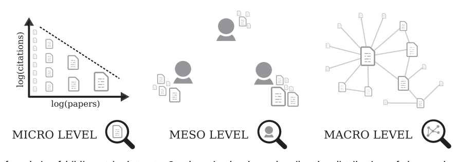
Fig. 1. Different levels of analysis of bibliometric datasets. On the microlevel we describe the distribution of the number of citations of individual papers, irrespective of who authored them as well as which articles actually referenced them. The rarely studied mesolevel, which is the perspective of this contribution, accounts for the author-specific differences. The structure of the citation network in its entirety is studied at the macrolevel.

For the derivation of the model please refer to Materials and Methods , Model Description . The citation process proposed above, after all of the N papers have been published and all of the citations have been distributed, yields the following analytic formula for the estimated number of citations of the kth most cited paper ( Materials and Methods, Exact Solution of the Model ):