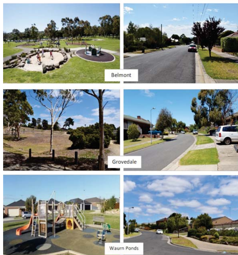
Figure 2. Show the physical environment features of the three selected suburbs.

The instrument comprised of 4 scales determining perceptions of residents neighbourhood experience through measuring : (1) neighbourhood attachment [15, 16]; (2) Neighbourhood satisfaction [17]; (3) Neighbouring [18, 19]; and (4) walkability and safety [3, 20], which are defined in detail elsewhere [21]. All the questionnaires consisted of closed-ended questions and all answers were ranked according to Likert scale (Figure 2).