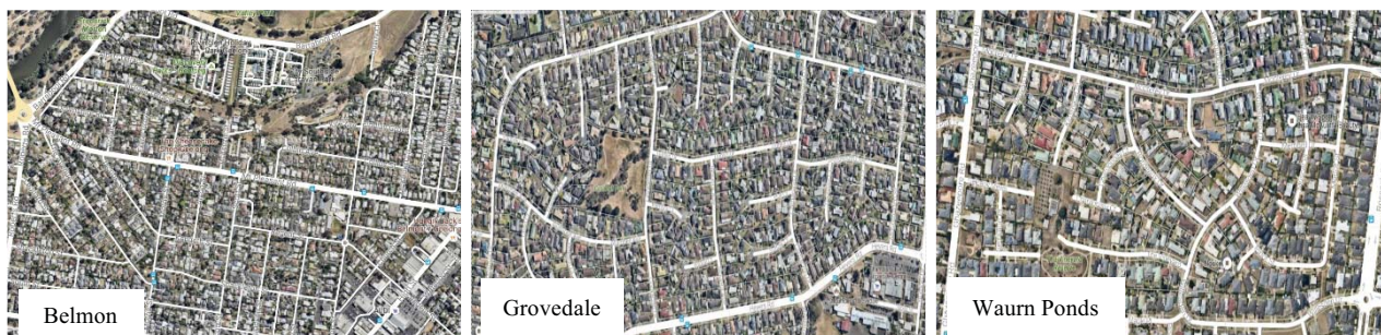
Figure 1. The three suburbs layout and selected residential streets

Quantitative methodology is used to investigate the influence of designed neighborhood on accessibility in low density housing. Data was collected via survey of residents in three suburbs with equivalent socio-economic profiles in Victoria, Australia. The three suburbs – “Belmont, Grovedale and Waurm Ponds” in “the City of Greater Geelong, which is the second largest city in Victoria. They are mainly categorized by low density, single land uses, single-family housing and car dependence (Figure 1.) They were selected for two key reasons: (1) socioeconomic equivalence, and (2) variety of design, as each was developed through different eras of suburban development and hence, they vary in urban design arrangement and architectural styles.