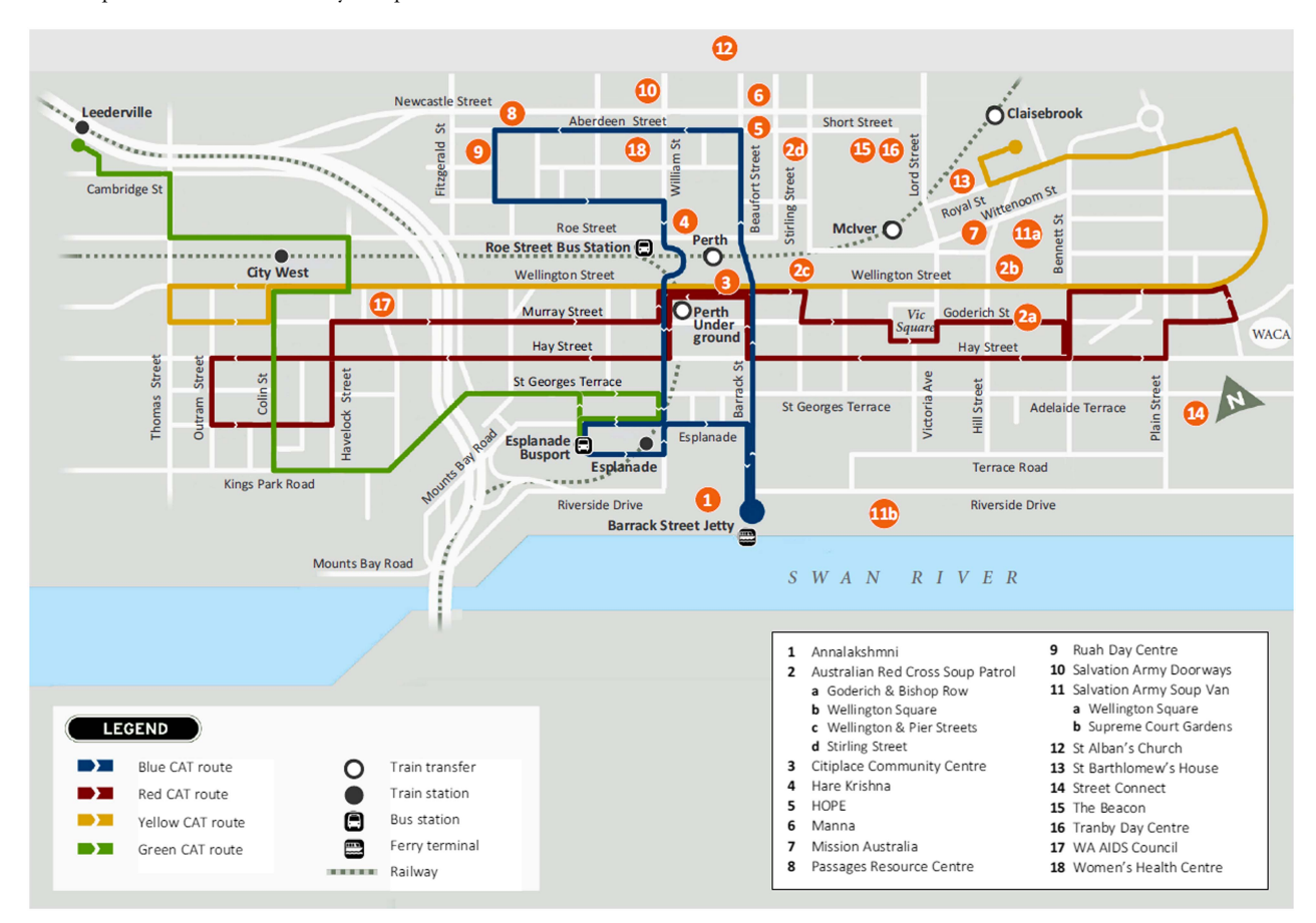
Fig. 1 Map of charitable food services in inner-city Perth, Western Australia, after disclosure of service locations used by interviewees, February 2016