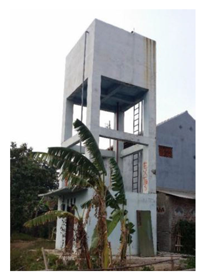
Figure 1. Water tank in Pasirsari, Cikarang.

riverbank in the Cikarang area. The CBWS systems worked by pumping groundwater 80-100 m below the surface, from a cross border aquifer, the Karawang–Bekasi aquifer, which is managed by the Energy and Mineral Resources Agency (EMRA) of the West Java provincial government. The water was collected in a 32 m<sup>3</sup> water tank tower (Figure 1) and distributed by gravity without treatment to homes via a pipe distribution system.