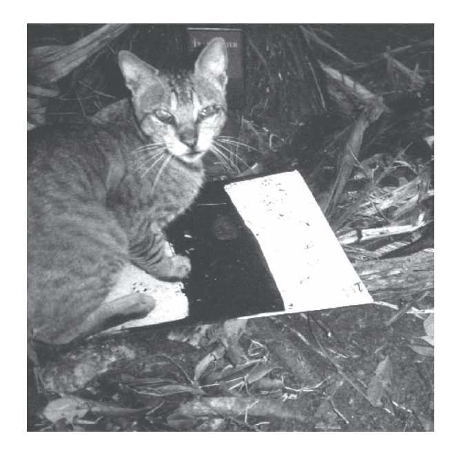
Plate 1 Application of a tracking plate to monitor invasive mammal species in the Caribbean National Forest, Puerto Rico (photo by D. Whisson).

per number of traps available, corrected for sprung traps. Rats were euthanized by cervical dislocation.