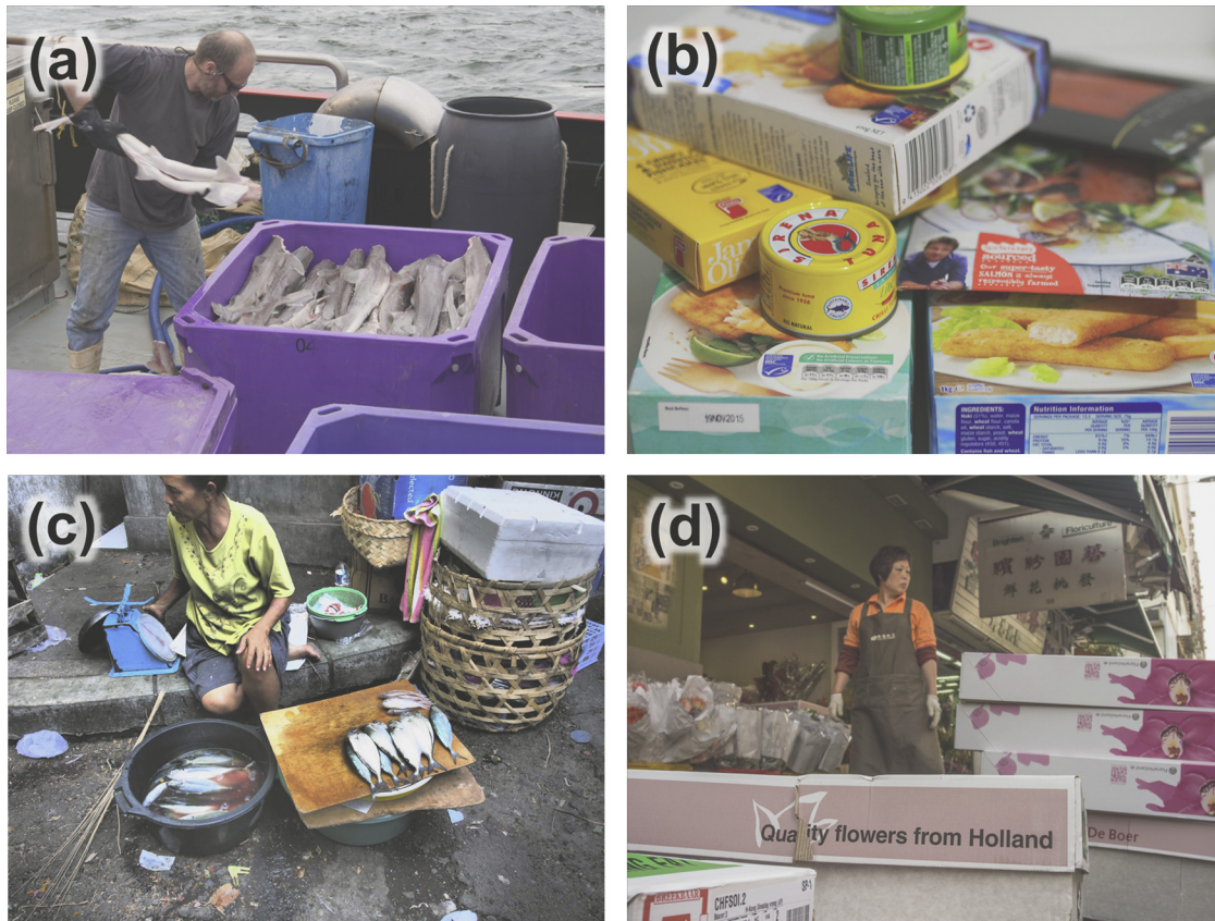
Fig. 2. Photos of (a) gummy shark Mustelus antarcticus being packed on ice for transport for the “fish and chip” industry; (b) popular seafood products found in Australian supermarkets containing sustainability certifications, including the Marine Stewardship Council’s “Certified Sustainable Seafood” products; (c) small-scale fisheries in Indonesia selling fresh, locally-caught fish; and (d) flowers grown in Holland are air freighted to Hong Kong.