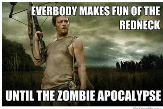
Walking Dead meme

The prison that has proven to be a place of comparative sanctuary for the protagonists in the past two seasons also has a limited supply of provisions, and hunting and gathering in the woods, is essential to supplement their diet and eke out supplies.